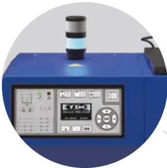
Optional visual and audible alarm for confirmation of filling