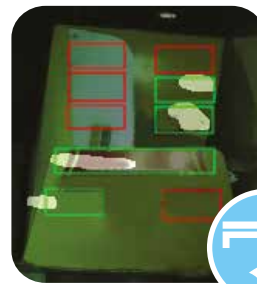
Crushed, torn or open flap