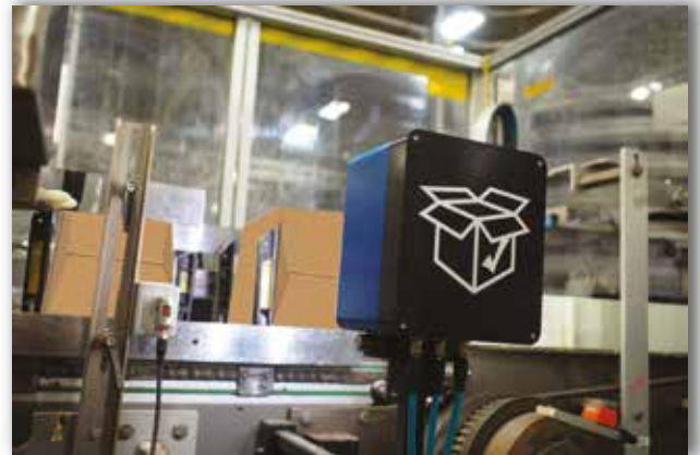
PackChek™ installed on a cartoning machine with a hot melt gluing system

PackChek™ is ClearVision's automated packaging inspection system that takes a thermal and visual image of every package to ensure that hot melt glue is applied in the correct location. Using the thermal image, PackChek™ finds the heat signature of each glue bead, verifies its position, and displays a user-friendly image.