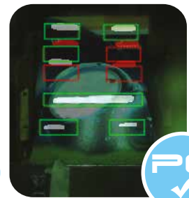
Misaligned glue beads